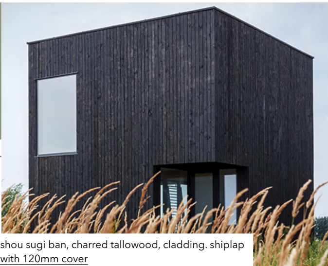
shou sugi ban, charred tallowood, cladding. shiplap with 120mm cover

Dulux western myall proposed for the trims and details. Dulux stowe white proposed to the window frames and gable end features. Dulux traditional sage green proposed to the window frames and gable end features.